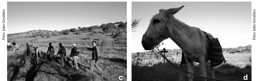
FIGURE 2: “Casa do Forno”. a – Trilobite’s cookies, b - Slices of Earth (tectonic pizzas), c - pedestrian trails, d - live reconstitutions.

Another revolutionary concept concerning GeoMarketing was the company Trilobite.Aventura (meaning Trilobite.Adventure) with outdoor activities, such as pedestrianism, slide, rappel, climbing, in the quartzite rocks with fossils from Penha Garcia. An innovative Geoproduct was the paintball championship – TriloPaint. This common outdoor activity was adopted and transformed in a typical product from the Geopark. Trilobite.Aventura also manages a bar located near the Fossils Trail, in a traditional quartzite building in the medieval core of Penha Garcia village. In February 2009 the company celebrated its first anniversary with a GeoCake illustrating the suggestive logo of Trilobite.Aventura. This trilobite-moving based on the outstanding trilobite trace fossils from the Ichnological park of Penha Garcia was transformed in logo and is always present in the trilobite team uniform (Fig. 3) and company’s image.