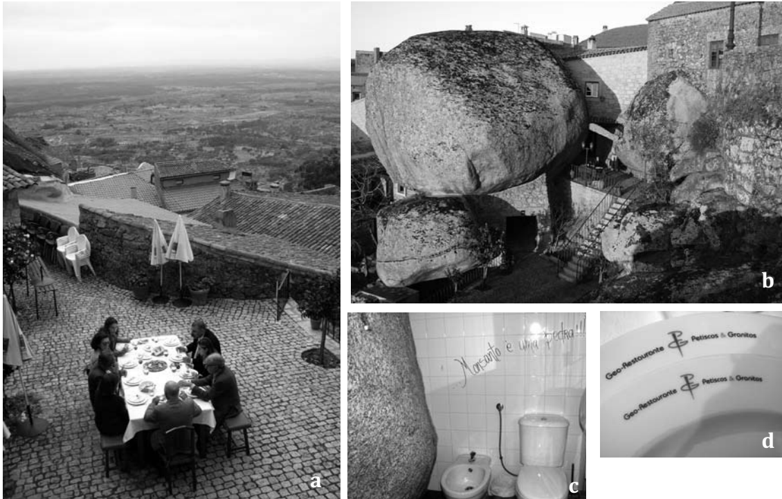
FIGURE 1: GeoRestaurant “Petiscos & Granitos”. a - Balcony over the Geopark landscape, b - terrace and “cave”, c - Geo Bathroom, d - GeoRestaurant dishes.

Almost in the extreme of the Geopark there is Casa do Forno, a GeoBakery and guest house, perhaps the first in the world (Fig.2). The GeoBakery has a very busy traditional oven that cooks besides traditional bread, Trilobite and Granulite cookies. After seeing the fossils in their context in the Geopark trails, why not taste them? But to understand the geological history of the territory, Casa do Forno suggests “The Slices of Earth” (tectonic pizzas on the plate) and Orogenic toasts for all the Geopark episodes (Cadomian, Variscan and Alpine). Casa do Forno, the guest house, offers not only comfort and rest but also geotourist activities, such as water trails, mining routes and reconstitutions of the traditional episodes, such as the smugglers route made by the Portuguese for centuries by crossing the Erges River. Here it is possible to have a delicious GeoDinner where you can start with Salted Schist’s and finish with egg cream Cliffs.