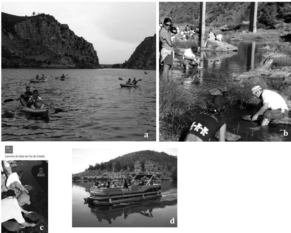
FIGURE 4: Incentivos Outdoor activities. a - GeoKayak, b - “There is gold at the Foz!”, c - Pedestrian Trails leaflet for GeoTrekking, d - boat trip in the Portas de Ródão Natural Monument.

It is an outdoor company which runs the boat trips to the Portas de Ródão Natural Monument and the Neolithic Tejo Rock Art. This visit along the quartzite crests and deeply-incised Tejo valley meets not only the Geodiversity but also the important avifauna, the historical and archaeological heritage. Besides these traditional boat trips Incentivos Outdoor also endorses GeoKayak in Portas de Ródão, in the Tejo River, but also in the Zêzere River meanders. In Foz do Cobreão Schist Village the company promotes a panning for gold activity with the local community. This activity called “There is gold at the Foz!” recreates the gold mining activity coming from Roman times until the the 1 st half of the 20 th century. The visitors are invited to take off the shoes, enter in the river and look for gold nuggets. In this village, the company runs a restaurant, in a traditional schist building with tasty traditional food and local products. Incentivos Outdoor presents also GeoTrekking and GeoCircuitos (GeoTrails) Programmes.