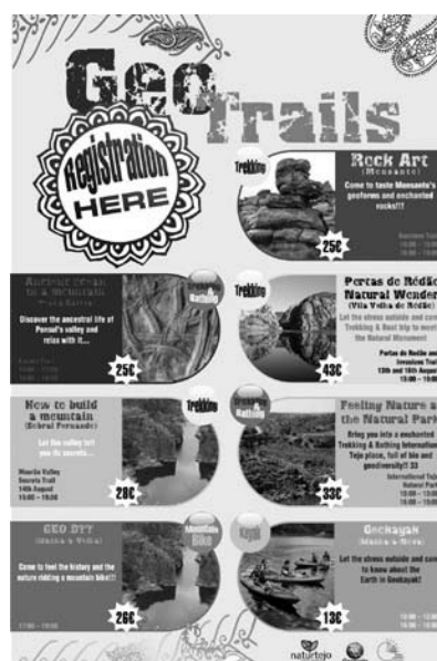
FIGURE 6: GeoTrails created for the BOOM Festival 2008.

Naturtejo encourages new projects in the territory and promote them in its activities. This is as long-term project and very innovative because the geological features that have been always present in the region for the local people now can be economically exploited through new opportunities for business and sustainable explored for the benefit of people .