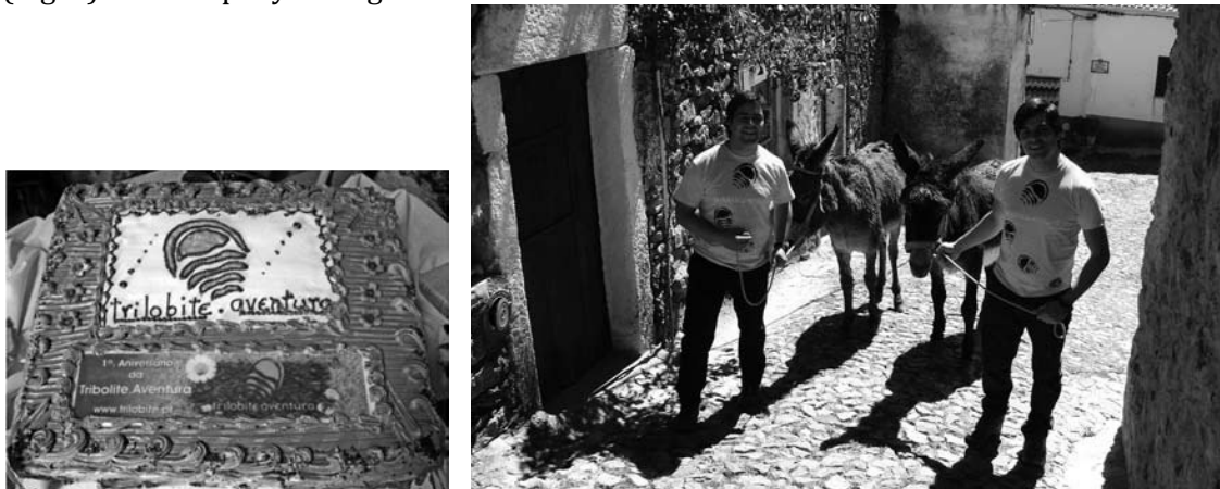
FIGURE 3: a - Trilobite.Aventura anniversary cake, b - The Trilobites’ uniform

Another revolutionary concept concerning GeoMarketing was the company Trilobite.Aventura (meaning Trilobite.Adventure) with outdoor activities, such as pedestrianism, slide, rappel, climbing, in the quartzite rocks with fossils from Penha Garcia. An innovative Geoproduct was the paintball championship – TriloPaint. This common outdoor activity was adopted and transformed in a typical product from the Geopark. Trilobite.Aventura also manages a bar located near the Fossils Trail, in a traditional quartzite building in the medieval core of Penha Garcia village. In February 2009 the company celebrated its first anniversary with a GeoCake illustrating the suggestive logo of Trilobite.Aventura. This trilobite-moving based on the outstanding trilobite trace fossils from the Ichnological park of Penha Garcia was transformed in logo and is always present in the trilobite team uniform (Fig. 3) and company’s image.